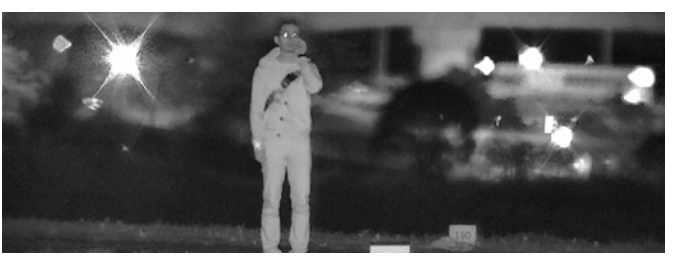
With Vari-Angle IR