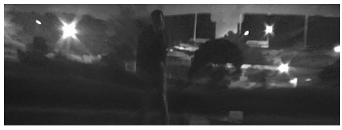
Without Vari-Angle IR