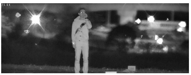
With Vari-Angle IR