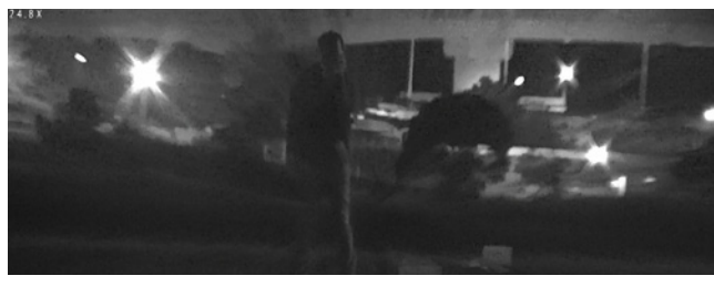
Without Vari-Angle IR